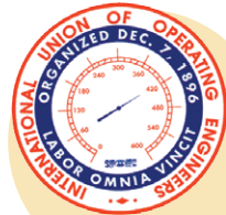
International Union of Operating Engineers