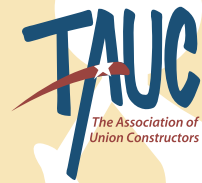
The Association of Union Constructors